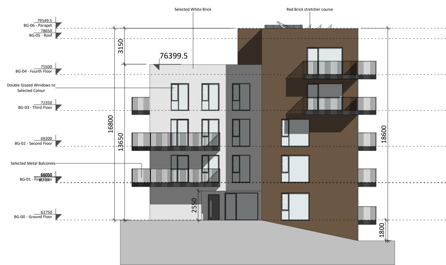
2 Block G East Elevation 1:200