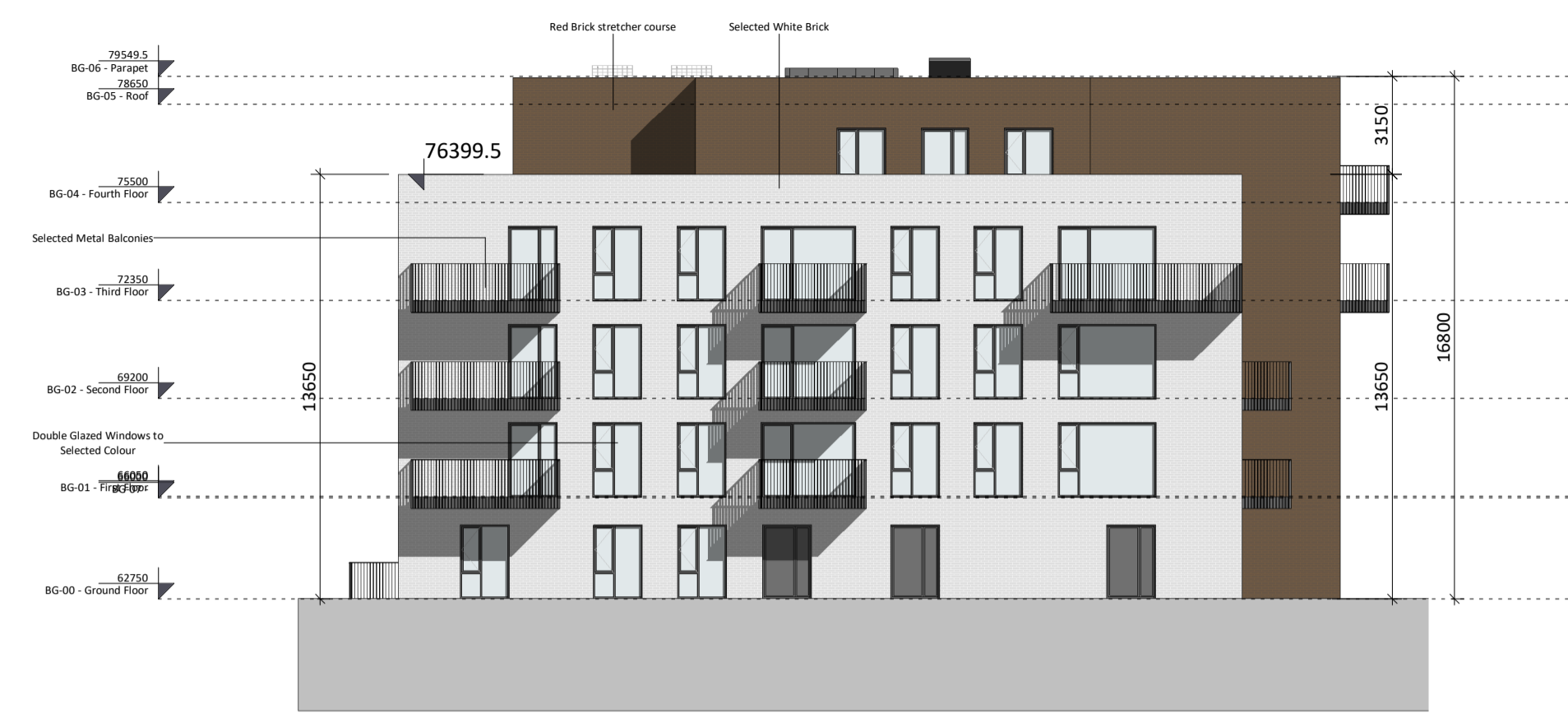
3 Block G South Elevation 1:200