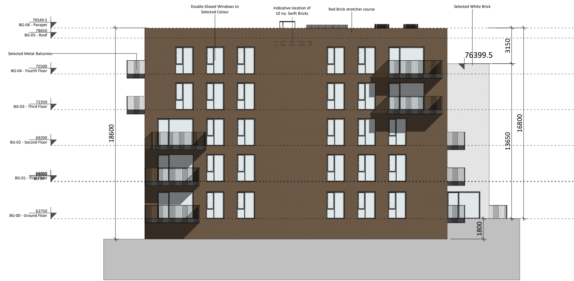
1 Block G North Elevation 1:200