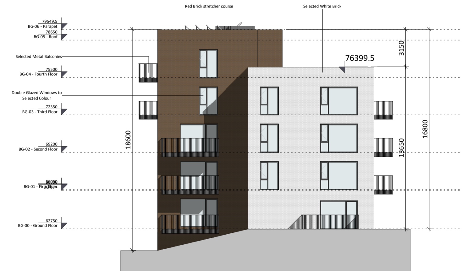
4 Block G West Elevation 1:200